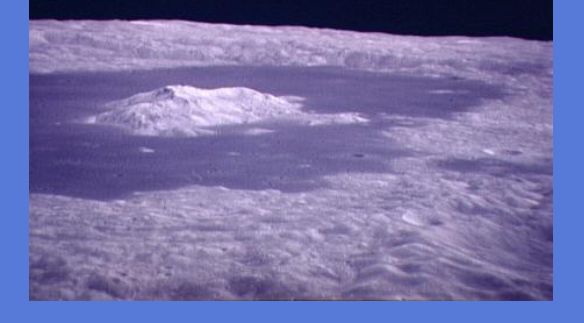
More challenging than the mountains on the Earth...